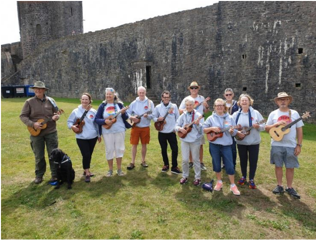
The group at Pembroke castle plus the ukulele mascot.