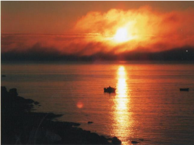
Early start Moelfre to Amlwch