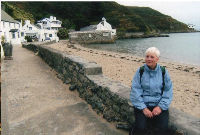
Ty Coch inn Porth Dinllaen