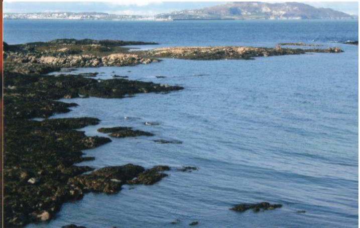
Church bay to Valley