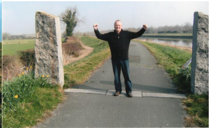
Chester Coastal paths end