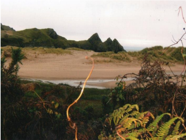
Three Cliffs bay Gower