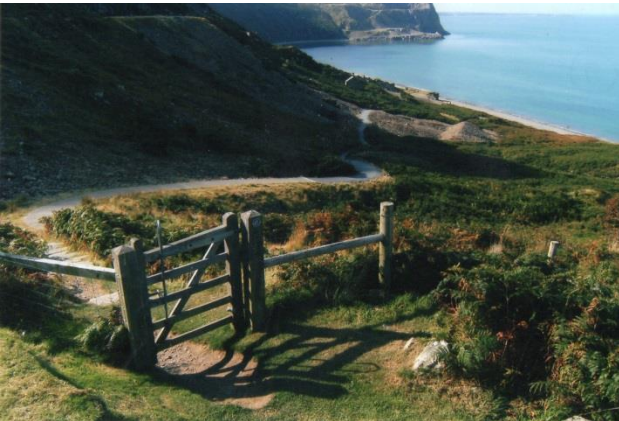
Nantgwytheyrn to Nefyn