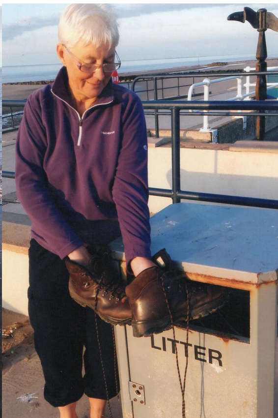
Paddle in the sea Prestatyn