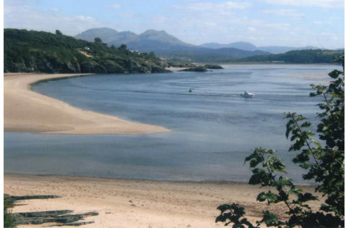
Borth Y Gest