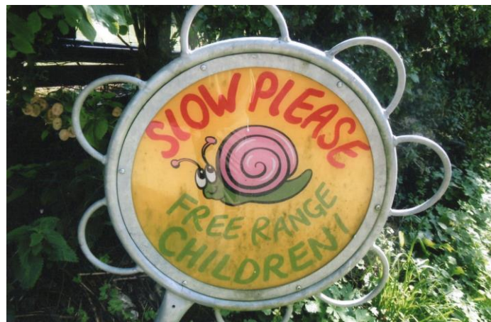
Funny sign Prestatyn